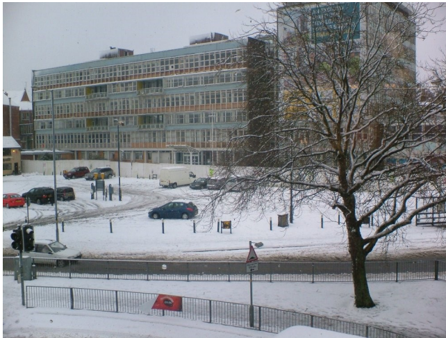
Regent Circus March 2004